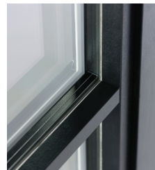
Black glass spacer shown

Choose from stainless steel, black or white glass spacers on select products to create a customized look. Add Full Divided Light grilles and the grille spacer bar between the glass will match the selected glass spacer color.